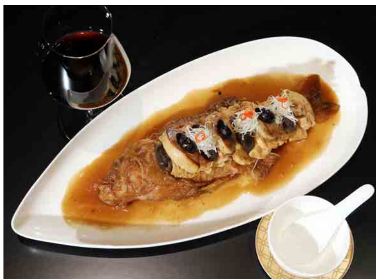
Clockwise from left: Chez Patrick's foie gras trio with orange and bitter chocolate sauce; Shang Palace's braised South African six-head abalone and pan-fried foie gras in abalone sauce, and stewed spotted grouper with foie gras and black garlic; Whisk's Scottish oyster with foie gras and grapefruit granita.

Roka Shop 002, Level LG1 Pacific Place, Admiralty Tel: 3960 5988 rokarestaurant.com.hk 22 Ships 22 Ship Street, Wan Chai Tel: 2555 0722 22ships.hk WHITE TRUFFLES Otto e Mezzo Bombana Shop 202 Alexandra House, 18 Chater Road, Central Tel: 2537 8859 ottoemezzobombana.com Grissini 2/F Grand Hyatt Hong Kong 1 Harbour Road, Wan Chai Tel: 2584 7722 hongkong.grand.hyatt.com Tosca 102/F The Ritz-Carlton, 1 Austin Road West, Kowloon Tel: 2263 2270 ritzcarlton.com/en/Properties/HongKong Man Wah 25/F Mandarin Oriental Hong Kong, 5 Connaught Road, Central Tel: 2825 4003 mandarinoriental.com/hongkong